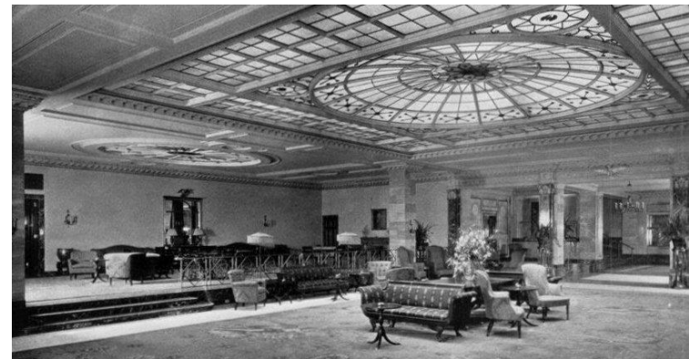
An early view of the Barclay Hotel lobby, before the installation of its famous bird cage in the 1940s. The domed laylight in the picture was replaced during the recent renovation with a flat one.