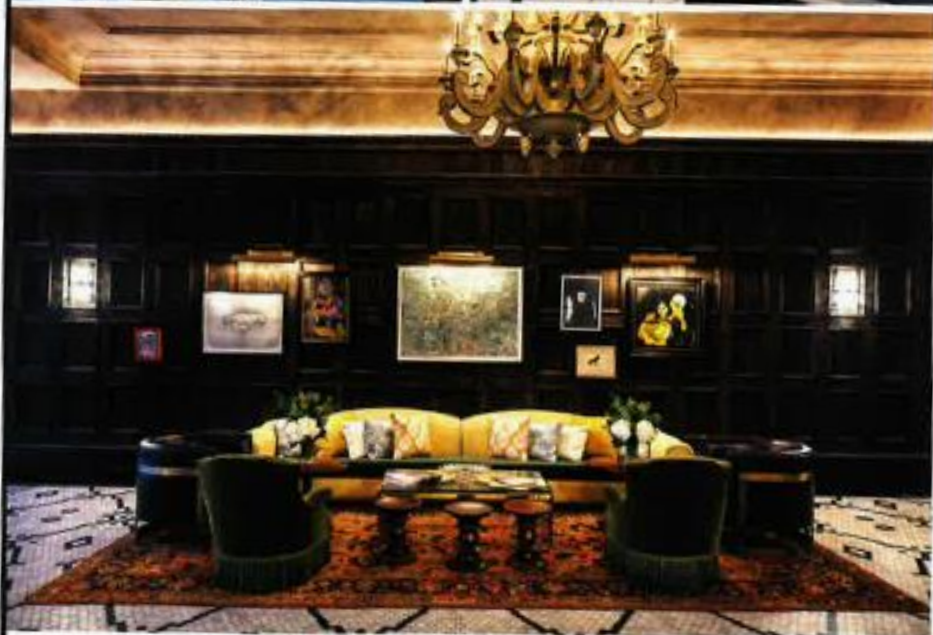
Clockwise from top left: 30 Park Place (leftmost tower), the Marmara Park Avenue, and the Beekman.