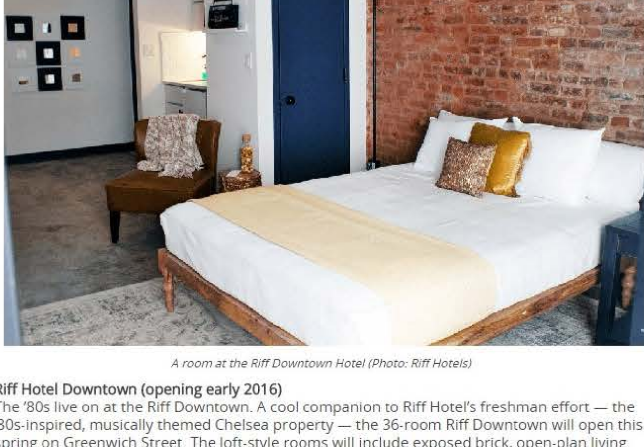
A room at the Riff Downtown Hotel

Spring is on its way, and with it, brand new places to lay your head in Manhattan. There's plenty to look forward to once the weather turns warm: From an '80s-inspired hip downtown spot to a revamped New York icon, these upcoming eight hotels are the ones to keep an eye on.