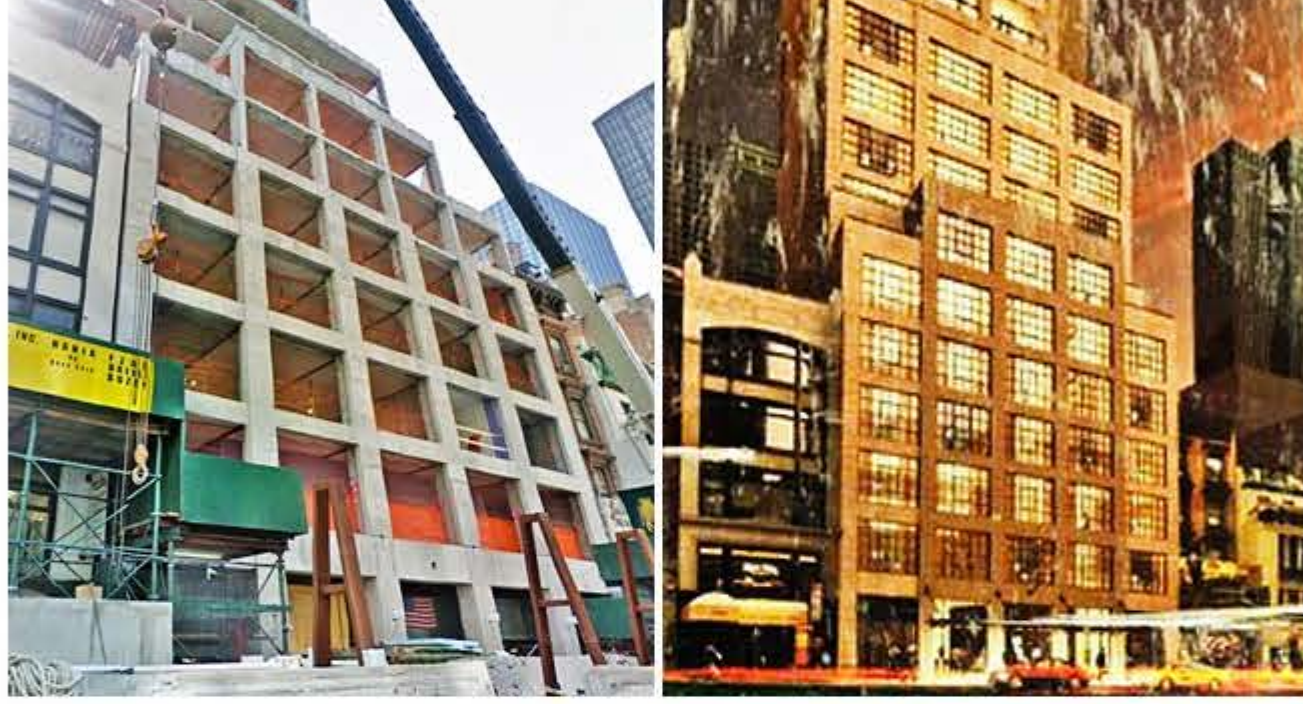
Construction underway at 18 W. 56th St., the future site of the Whitby Hotel; inset: Rendering of the hotel

There's a new kid on Wythe Street. The modern-chic, boutique Williamsburg Hotel (perhaps a rival to the street's original) has plans to open this spring. The eight-story, 150-room property will have a restaurant, rooftop pool (complete with stunning NYC skyline views) and the neighborhood's first grand ballroom with 30-foot ceilings and capacity for 400. Guests will also have three bars to choose from, including one of which will be set in a water tower replica as a nod to the block's history. Meanwhile its industrial façade — another shout-out to the area's past — will be fashioned of brick, glass and steel, while interiors will have double-height ceilings, floor-to-ceiling windows and natural finishes. 96 Wythe Ave., thewilliamsburghotel.com