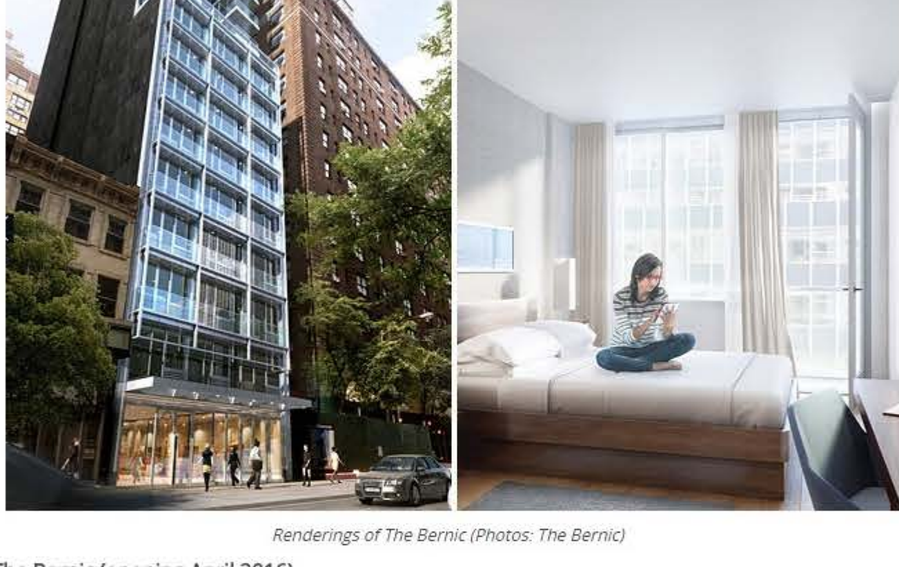
Renderings of The Bernic

The '80s live on at the Riff Downtown. A cool companion to Riff Hotel's freshman effort — the '80s-inspired, musically themed Chelsea property — the 36-room Riff Downtown will open this spring on Greenwich Street. The loft-style rooms will include exposed brick, open-plan living spaces and punchy black-and-white design accents; some will have private balconies overlooking the city. And while the budget-minded spot has plans for an upcoming bar with light bites, the rooms are equipped with handy kitchenettes with refrigerator, microwave, stovetop, dishwasher and sink. Plus, complimentary coffee and tea are offered daily in the lobby. 102 Greenwich St., riffdowntown.com