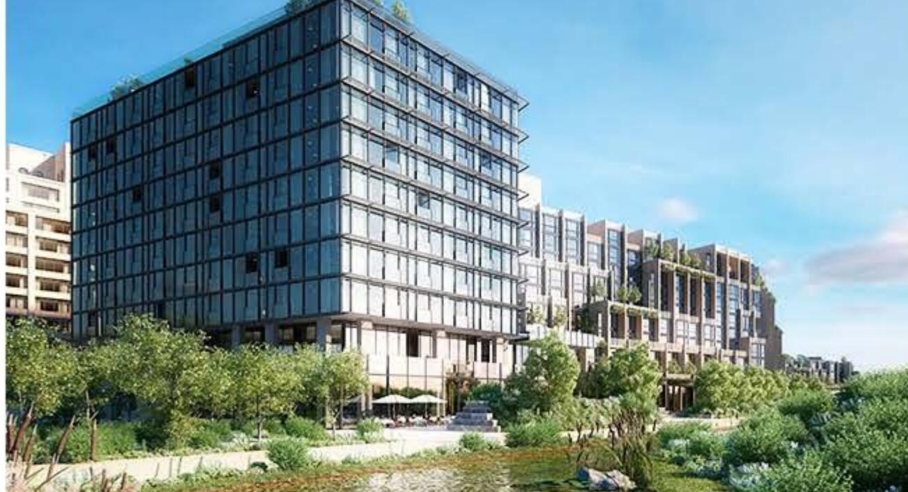
A rendering of 1 Hotel Brooklyn Bridge Park

The British are coming in the form of Whitby Hotel. Brought to you by Kit Kemp and company, the same design team behind the quirky Crosby Street Hotel, the new spot is set to open in the heart of Midtown in late summer. Similar in structure and stunning to its downtown sister, the 15-floor Whitby will have 86 rooms and suites, including a stunner two-bedroom accommodation that will encompass the entire top floor and feature two terraces with views to the north and south. The ground-floor bar, as well as a cozy drawing room and terrace, will serve as a gathering place for guests. And expect a 120-seat state-of-the-art cinema too. 325 W. 45th St., firmdalehotels.com