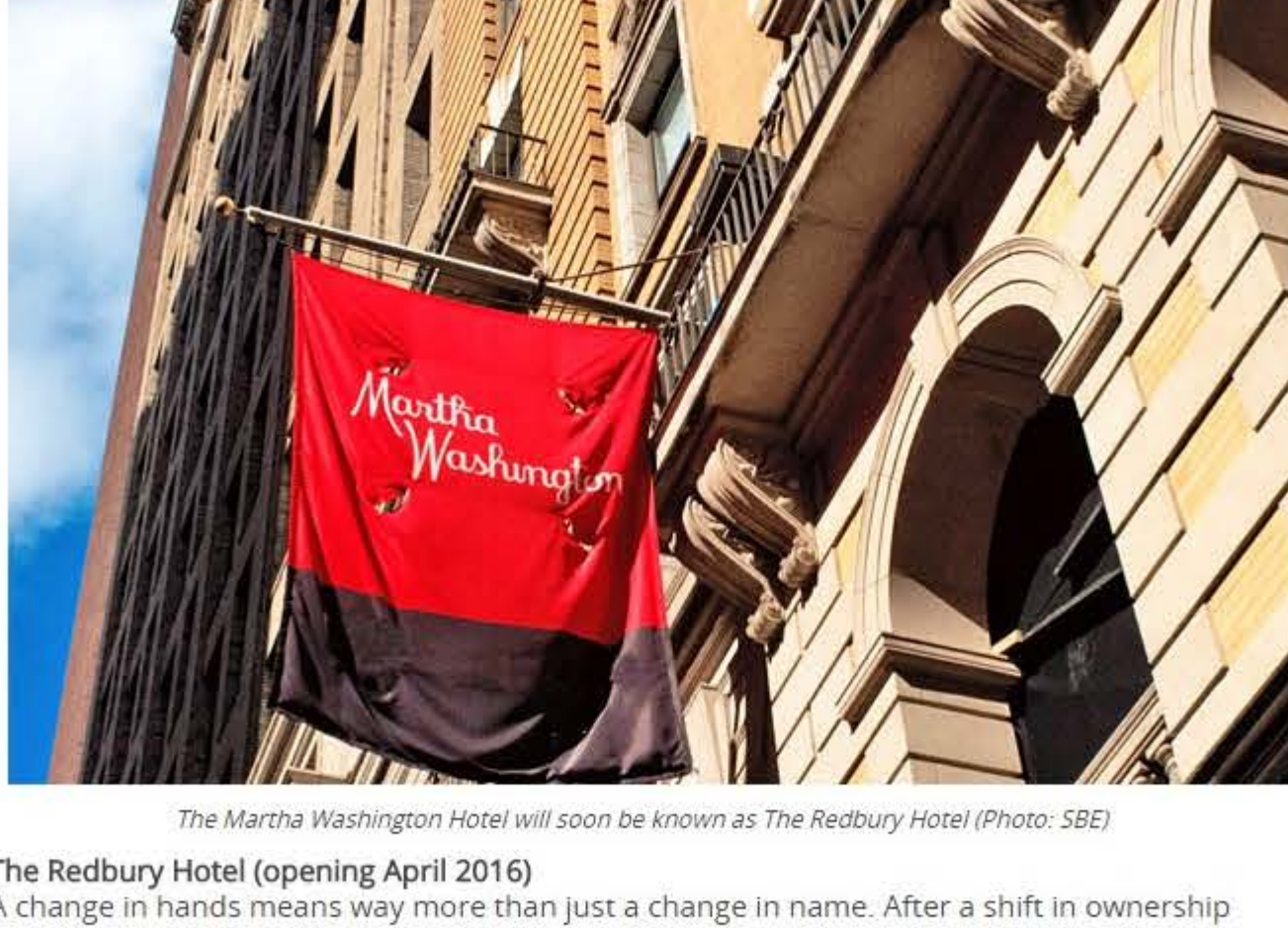
The Martha Washington Hotel will soon be known as The Redbury Hotel

Just as winter turns to spring, a winter debut has turned into a spring entrée. The Bernic hotel in the Turtle Bay area of Manhattan plans to welcome guests this April. The 21-story boutique spot, outfitted in a glass-and-gunmetal façade, is where art and technology converge. The 96 guest rooms have floor-to-ceiling windows, flatscreen Apple TVs and glass-encased balconies that seem to float in the sky. The hotel commissioned mixed-media artist Ian Sklarsky to produce murals of iconic cityscapes such as London, Paris and Shanghai that will adorn guest room walls. Then there's Allora restaurant and rooftop lounge, which will serve Northern Italian-American specialties alongside 360-degree views of Manhattan. 145 E. 47th St., thebernichotel.com