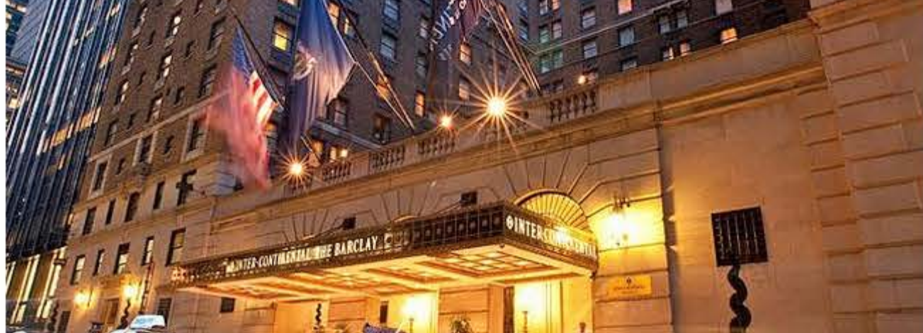
The facade of the InterContinental New York Barclay hotel