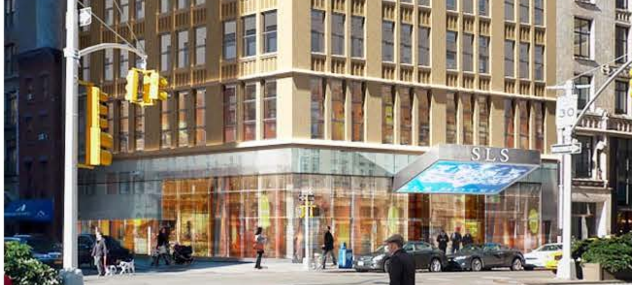
Rendering of SLS Park Avenue

Hot on the heels of a successful Manhattan venture, 1 Hotels is looking to conquer another borough. The new 1 Hotel Brooklyn Bridge Park — located right on Brooklyn's new riverfront park and featuring prime views of the East River, Statue of Liberty and Manhattan skyline — will focus on nature and sustainability just like its Central Park sibling. Drawing from its surroundings, the hotel uses shipping containers, pilings and pier as design inspiration and incorporated a million panes of glass to create a seamlessness between outdoors and in. The 194 guest rooms will have floor-to-ceiling windows, eco-friendly Keetsa mattresses and reclaimed materials. And award-winning chef and restaurateur Seamus Mullen will head a farm-to-table restaurant, while a rooftop bar and lounge will offer a plunge pool for hot days and fire pits for cold nights. 60 Furman St., 1hotels.com/brooklyn_bridge