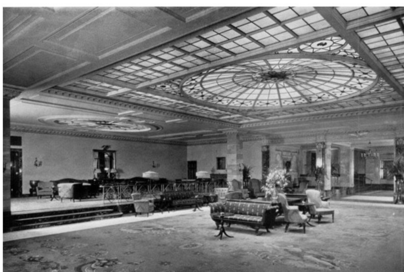
An early view of the Barclay Hotel lobby, before the installation of its famous bird cage in the 1940s. The domed skylight in the picture was replaced during the recent renovation with a flat one.